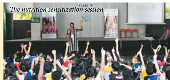
The nutrition sensitization session

The event at the TGAA started off with a sensitization session with the children on the importance of nutrition, sanitation and avoiding junk food. It was quite a sight when a "Junk Food Monster" made an appearance but couldn't scare the young children of Green Acres Academy since they had already promised to eat healthy!