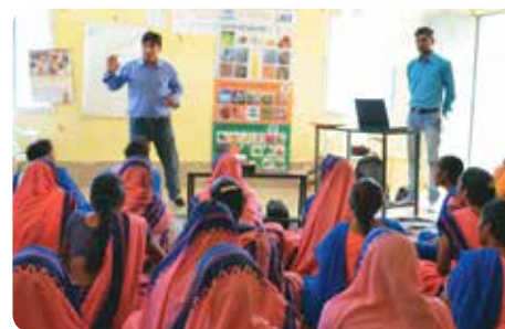
Training front-line healthcare care workers in Dhar, Madhya Pradesh

As a core component of making our programme self-sustainable in the long run, our team in Dhar, Madhya Pradesh conducted a refresher training course for over 500 healthcare workers. With the objective of strengthening the Government healthcare structure, the workers were trained on identifying signs of acute malnutrition in children under 5, nutrition practices for infants and mothers and various aspects of sanitation. The healthcare workers, known as Anganwadi and Asha workers, are usually the first point of contact for children and mothers on health and nutrition.