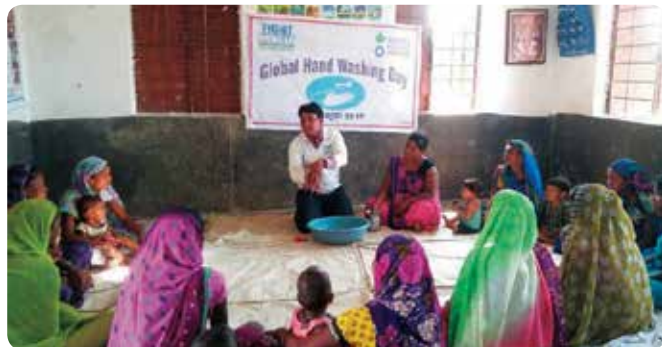
Learning the 5 steps of hand-washing at Burhanpur, Madhya Pradesh

The national breastfeeding week in August saw active participation from families across our programme in Maharashtra, Madhya Pradesh and Rajasthan. While over 1400 pregnant/lactating women and new mothers came together to discuss the importance of breastfeeding in Dhar and Burhanpur (Madhya Pradesh), women in Baran, Rajasthan weren't to be left behind as close to 1000 of them came