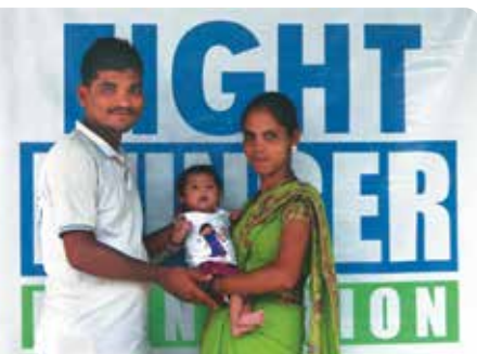
We completed a year in Palghar, Maharashtra