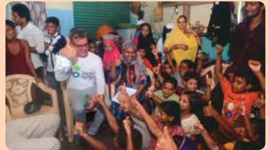
The visiting team from UK interacting with children in Govandi

The visiting team from UK interacted with children and mothers and spent the day visiting homes and our Outpatient Treatment Centres.