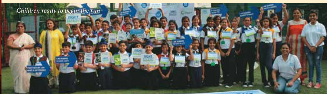
Children ready to begin the run

We salute the School The Green Acres Academy for their support!