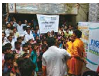
The junk food monster in Palghar & a street play in Govandi, Maharashtra

Palghar and Govandi in Maharashtra were buzzing with excitement as the Junk food Monster paid them a visit during the National Nutrition Week in September. The monster put up quite a show on the ill effects of junk food and egged families to inculcate healthy eating habits. Young children in Govandi dressed up as their favourite fruits and vegetables and learned about their nutritional importance. This was followed by a street play witnessed by close to 300 local community members on the importance of a good diet in the early years of a child. More than 1200 mothers and adolescent girls in Burhanpur and Dhar (Madhya Pradesh) enthusiastically participated in group discussions on food choices, cooking demonstrations and video lessons.