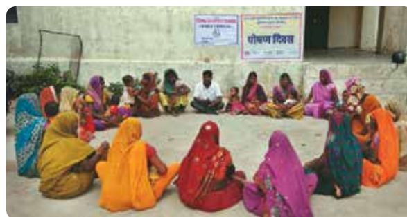
A discussion with mothers on child nutrition at Baran, Rajasthan

together and raised awareness in their communities on nutrition for infants and adolescent girls. World food Day and Global Handwashing day too were celebrated with families in the 480 villages where we work in India with information sessions on food choices and optimal sanitation practices. Children under 6 practiced the 5 steps of hand washing as mothers exchanged notes on water filtration and storage.